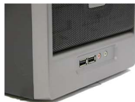
Front USB/ Audio Port