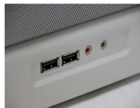
Front USB/ Audio Port