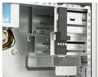
Quick-Release Drive Cage Tool-Less Design