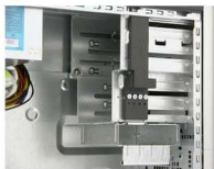
Quick-Release Drive Cage Tool-Less Design