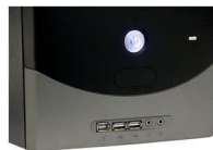
Front USB/ Audio Port