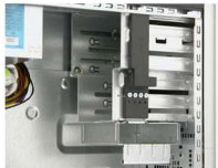
Quick-Release Drive Cage Tool-Less Design